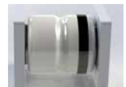
Surface Mount Package