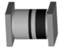
Surface Mount Package